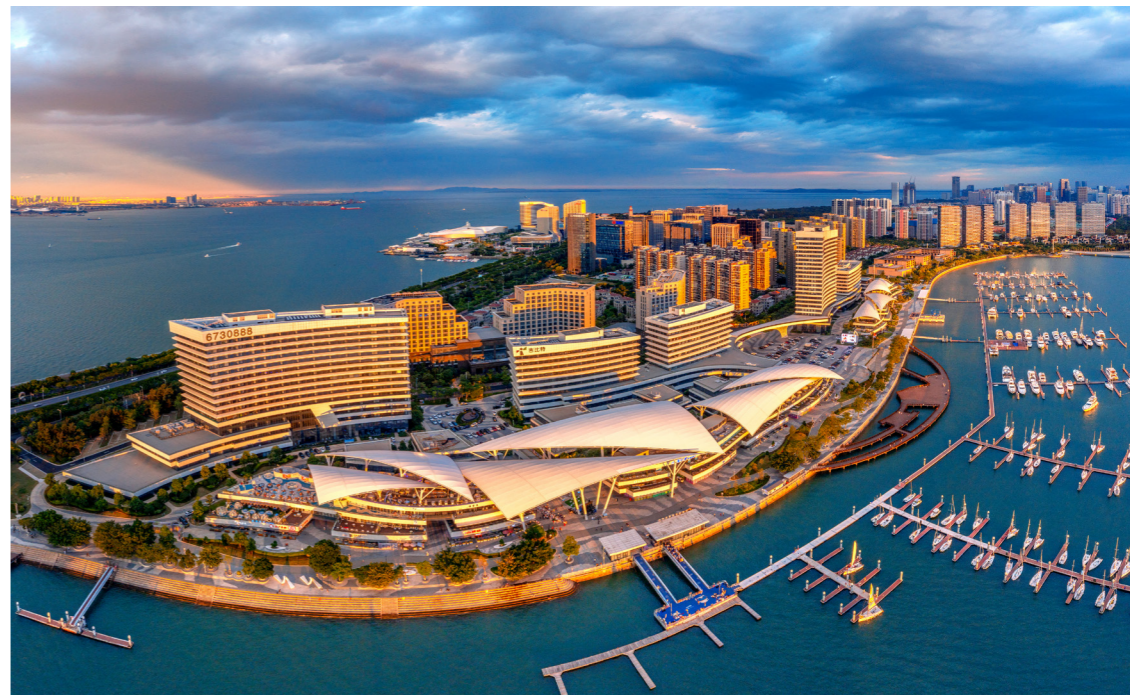
厦门国际游艇汇 Xiamen International Yacht Club

We focus on developing regional financial technology hubs and sustainable finance centers while attracting and gathering fintech companies. We highlight distinctive areas such as investment and financing and supply chain finance, and put emphasis on key sectors like fintech and green finance.